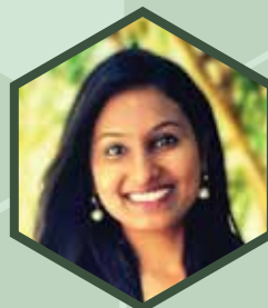
MADHURI BOMBLE @madhuri_makeup_mehendi