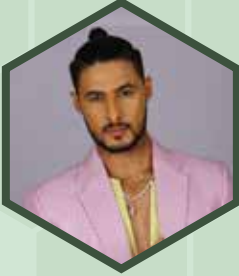
ZAHEER KHAN @as.zaheer